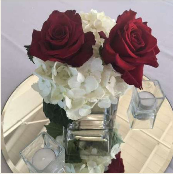
Floral Centerpieces with Seasonal Flower $15.00 and up